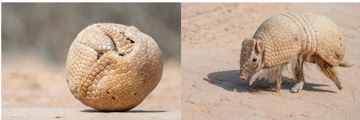
Southern Three-banded Armadillo

We decided to drive the road to Cerro Leon from Madréjon during the day, as it was still relatively cold and the nights and mornings before had produced almost 0 good sightings. Another trip report (Bocquier, 2012) stated that a peccary hunter had told them that during cold days/nights cats walk the roads during the day. Cold is relative, but either \pm 20^{\circ}\text{C} isn't cold enough or the cats were walking different roads, but we didn't see any. The only mammal we observed was a cute-as-always Southern Three-banded Armadillo crossing the road. We suddenly heard a pishing sound and that turned out to be one of our tires being pinched by a thorn. Well, we thought it was a thorn but it turned out to be a piece of wood enough to make a decent campfire. After changing our tire we were now left without a spare, which altered our plans of staying multiple nights at Cerro León. The 5km entrance road is not in very good state, and we would advise to only drive to the water hole ( -20.43912, -60.32001 ) and maybe walk up to the viewpoint ( -20.43217, -60.3168 ) for a nice view of hilly Chaco. Unlike at the other parts of the park there are no beds to sleep on (just empty rooms, besides the Przewalsky's Geckos ( Phyllopezus przewalskii )), nor is there electricity or water. There is ample space to camp though, and we had a nice quiet night.